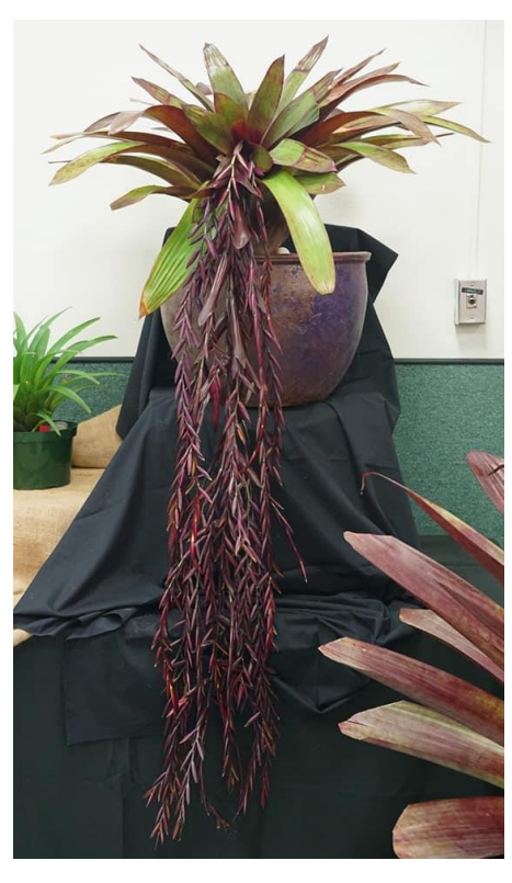
A couple views of the exhibit plus, above, xVrieslandsia Arden's Comet (Vr. simplex x T. australis). Left: Tillandsia 'Silver Queen'

Visit the San Diego Bromeliad Society Facebook page for more pictures and a video of the show.